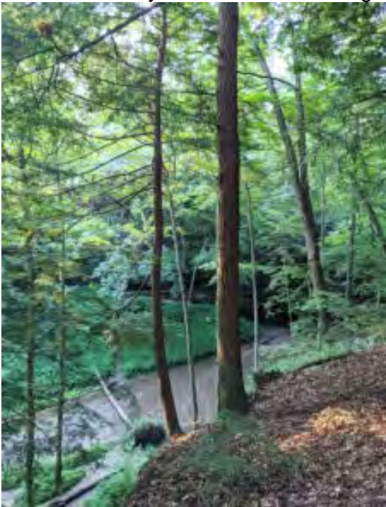
Figure 3: Eastern hemlock growing on a steep slope.