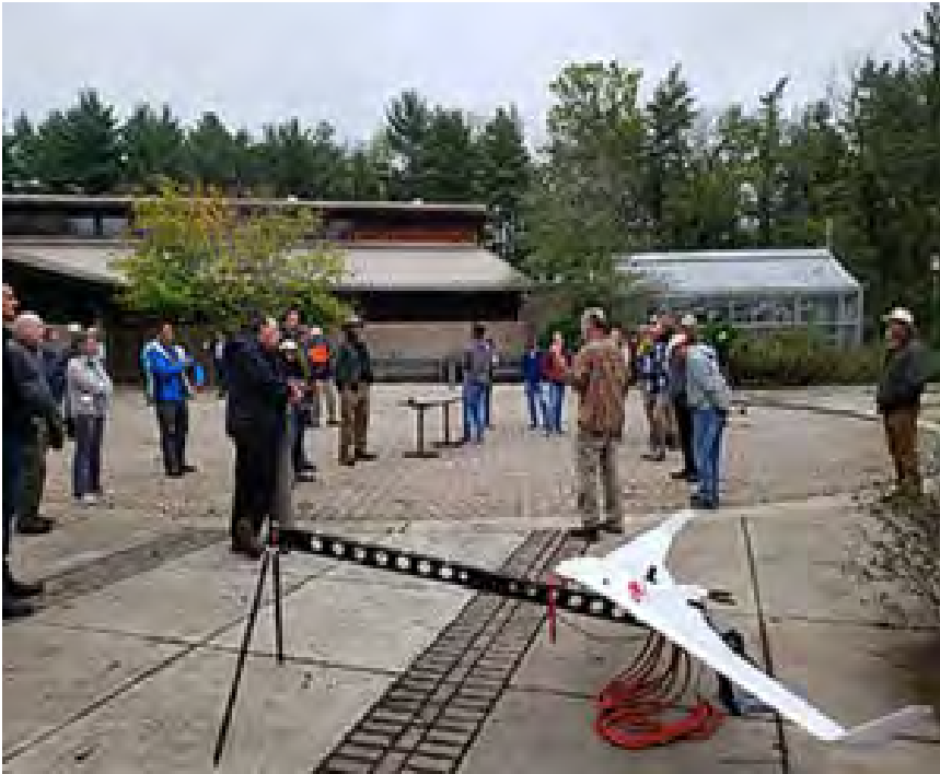
Figure 2. Attendees were provided demonstrations of the drones and camera/sensor technology used in digital forestry data collection