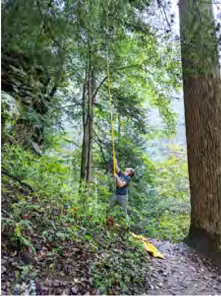
Figure 4: Collecting needles and cones from eastern hemlock with a pruning pole.