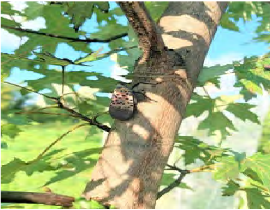
Figure 2. Adult spotted lanternfly

More information about spotted lanternfly