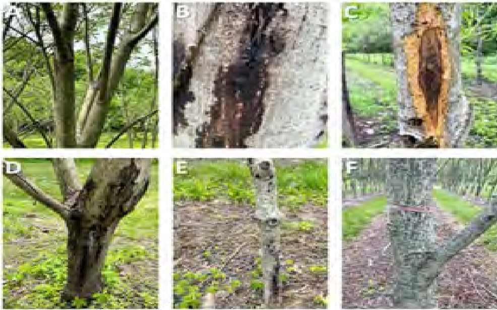
Figure 2. Butternut Canker disease (BCD). An introduction to BCD symptoms starting with a (A) healthy butternut tree, (B) an oozing canker, (C) the full extent of a canker after the bark is peeled back, and the three disease severity classes discussed (D) susceptible, (E) intermediate, and (F) resistant.