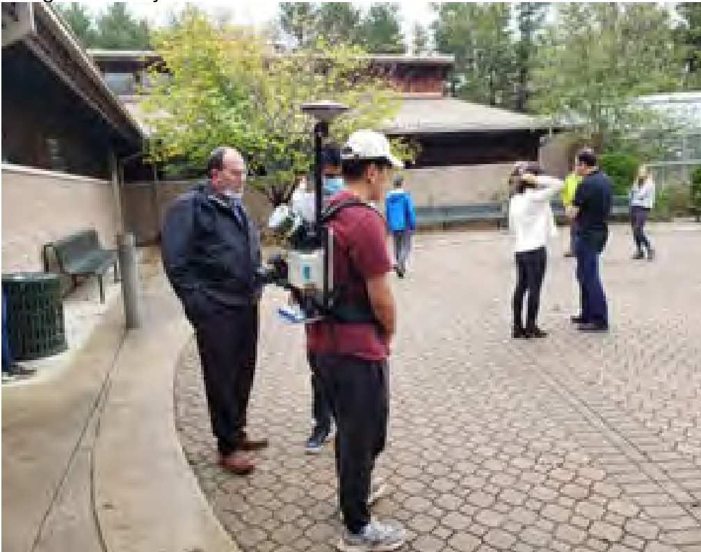
Figure 3. The prototype LiDAR backpack and software were demonstrated by multi-disciplinary students working on the project.