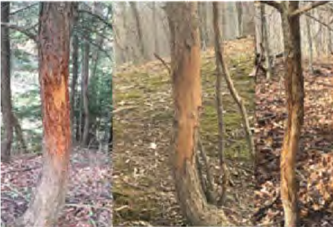
Figure 1. Examples of injury to eastern hemlock from deerrub.

Our research, supported in part by Purdue University, the USDA Forest Service, and the Indiana Academy of Sciences, aims to understand the genetic diversity of Indiana's hemlocks, how their diversity affects their reproduction, and whether injury from deer is constraining hemlock's ability to maintain self-sustaining populations in Indiana. As mentioned above, Rathfon spent the past year collecting samples of needles and cones from representative eastern hemlock populations in Indiana, measuring tree size and abundance, and observing injury from deer rub. Now, working in the genetics laboratory at Purdue's Department of Forestry and Natural Resources, she is using DNA extracted from the needle samples to understand how much genetic diversity is maintained in the stands she visited. By germinating the seeds from the cones she collected, she expects to gain insight into whether inbreeding and small population sizes are affecting the reproductive health of the stand. She expects to publish a full report of her findings in about a year.