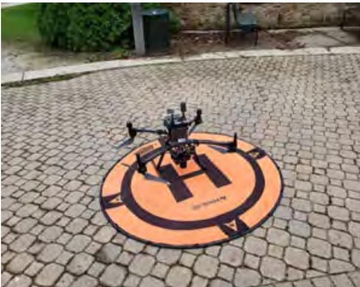
Figure 1. Attendees were provided demonstrations of the drones and camera/sensor technology used in digital forestry data collection.

Learn more about the people and HTIRC funded projects behind the new Integrated Digital Forestry Initiative: https://ag.purdue.edu/digital-forestry/