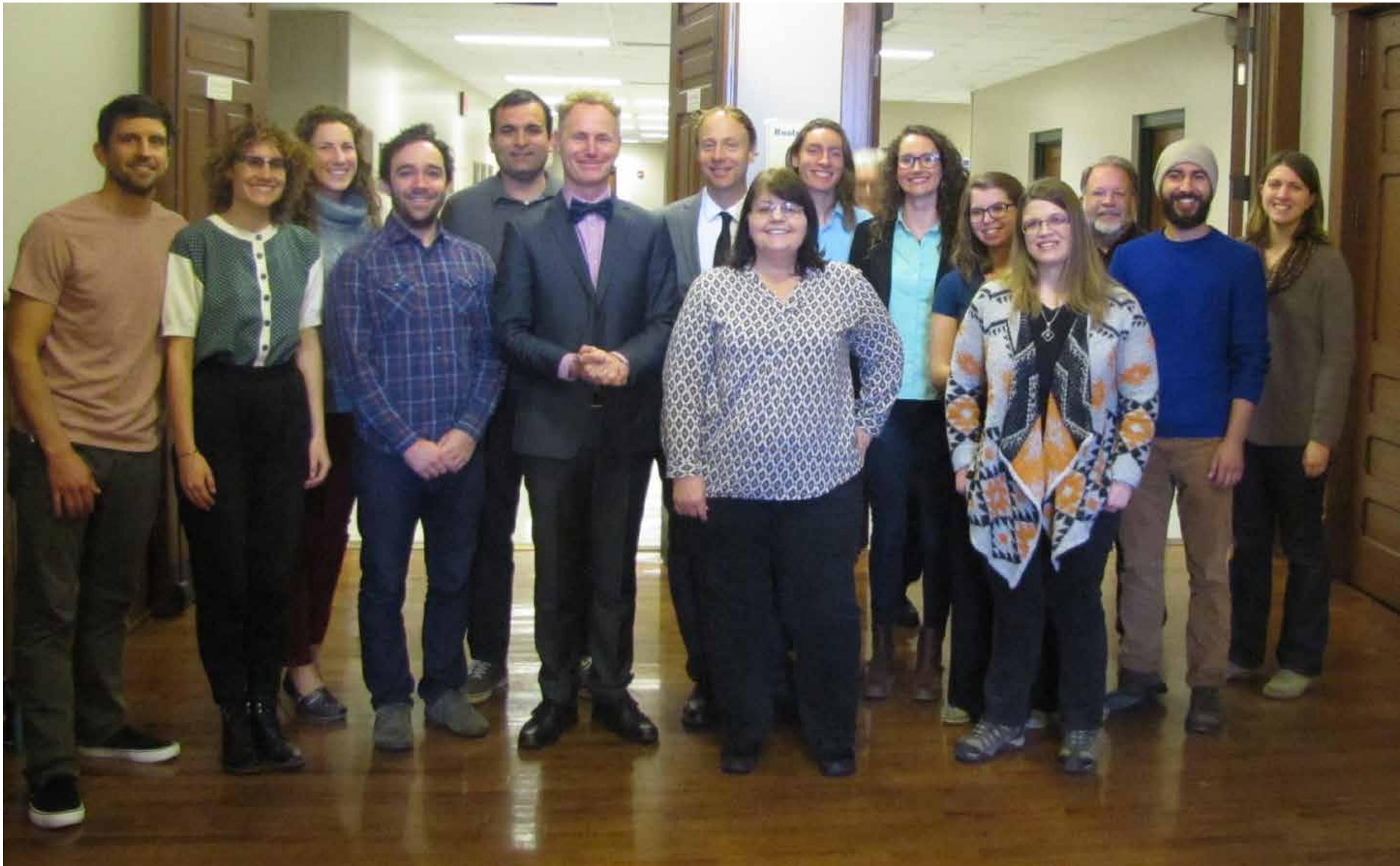
This is a picture of some of the HTIRC staff, graduate students, and professors.