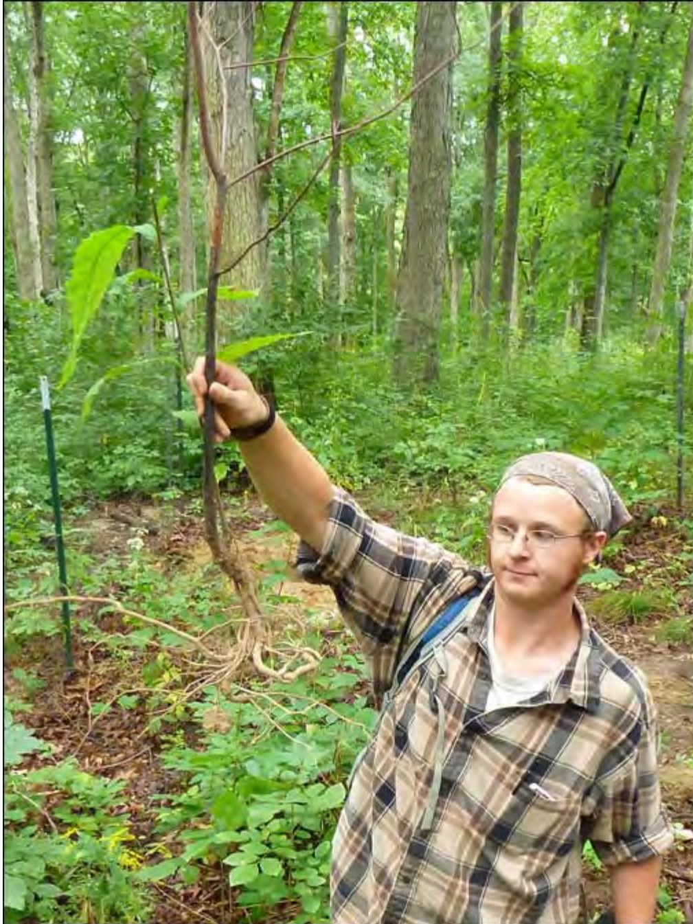
Figure 2. This American chestnut seedling was slightly smaller than average, and due to its small root system, it was unable to produce more than one small sprout (to the left of the dead stem) following surface fire topkill.