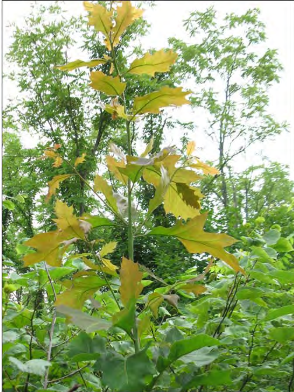
Figure 3. This oak sprout benefitted from the original seedling's large root system and ample carbohydrate reserves (original seedling was 7.5 ft tall and 1.5 inches dbh). This sprout is more than 9 feet tall just 3 months following surface fire topkill, and is already taller than the surrounding vegetation. Long-term, its chances of canopy recruitment are much better than smaller, less vigorous sprouts.