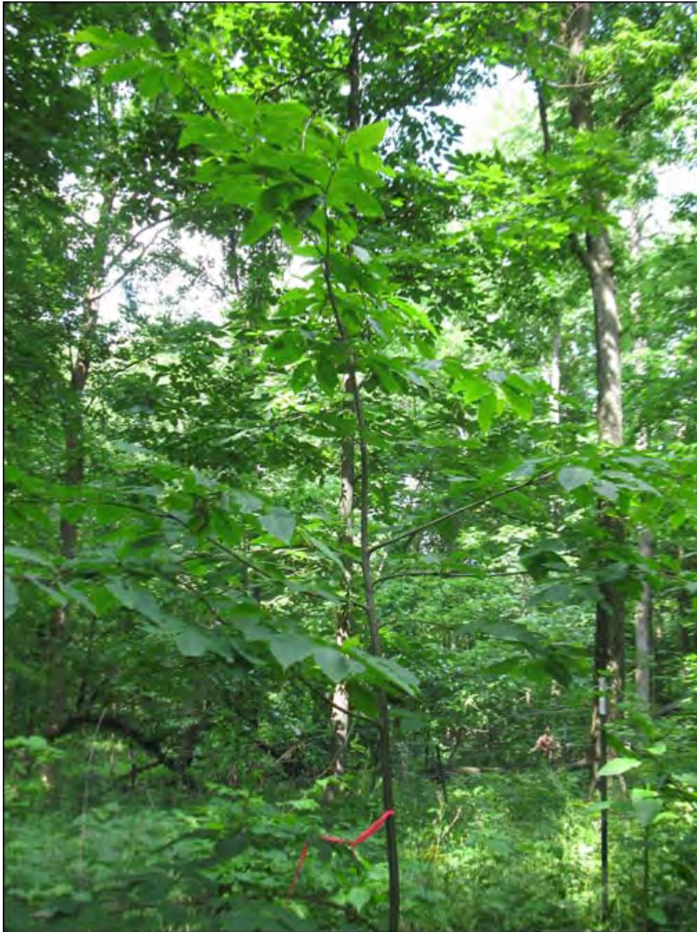
Figure 1. This American chestnut sapling stands just over 17 feet tall after 4 years in the understory. This fast growth is due in part to its wide crown which efficiently captures all available light and minimizes self-shading.

When combined with a multi-stage shelterwood, this may constitute a viable restoration strategy for chestnut in many of the eastern oak-hickory forests where it was originally dominant.