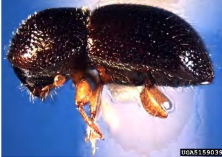
Figure 1. The black stem borer, Xylosandrus germanus .