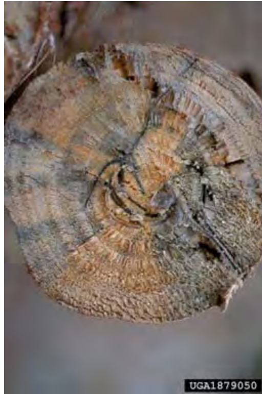
Figure 3. Ambrosia beetle galleries and blue-staining fungi.