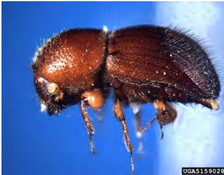
Figure 2. The granulate ambrosia beetle, Xylosandrus crassiusculus .