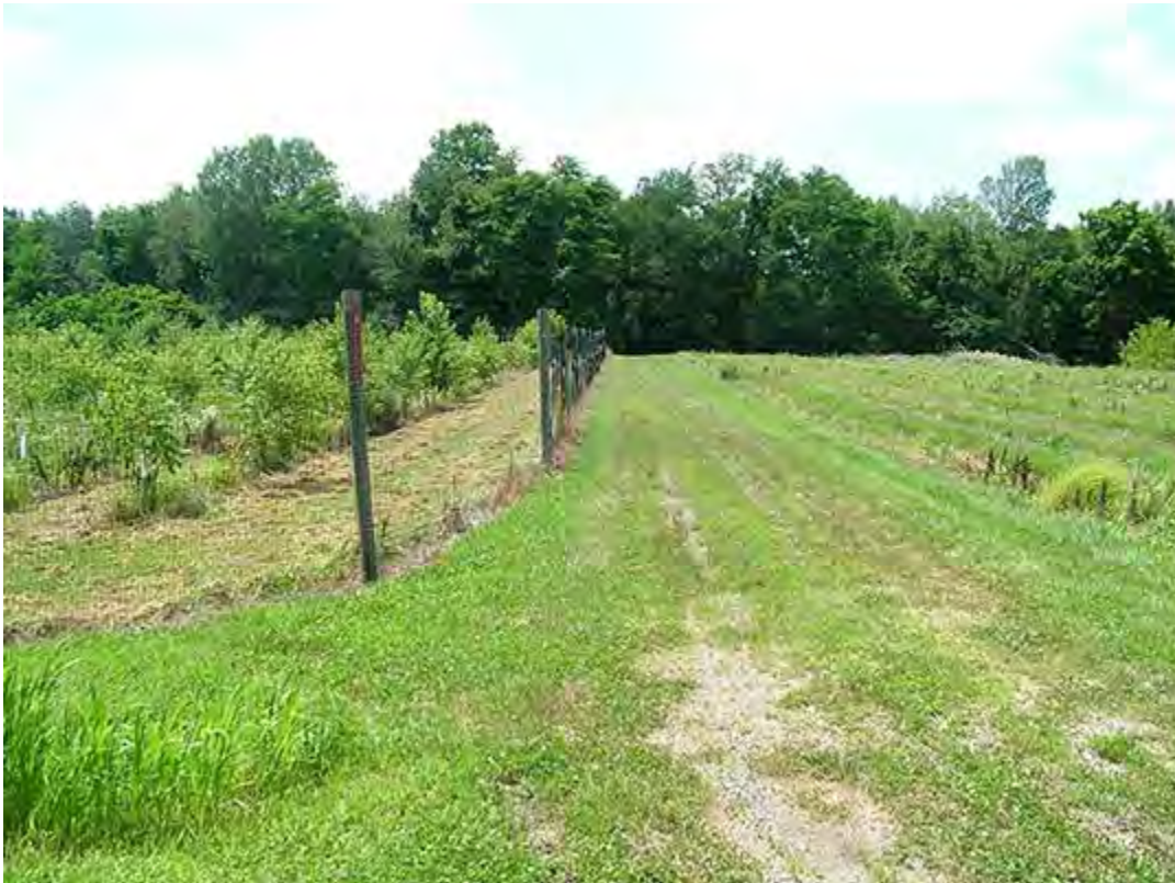
Black Walnut, black cherry, red oak and white oak seedlings three seasons after planting, protected by plastic mesh deer fence on the left and no protection from deer browsing on the right.

The publication How to Build a Plastic Mesh Deer Exclusion Fence can be accessed at: https://www.extension.purdue.edu/extmedia/FNR/FNR-486-W.pdf