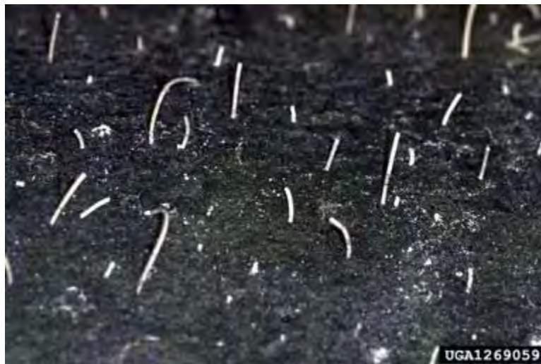
Figure 4. Toothpick-like structures protruding from the bark, an initial sign of an ambrosia beetle infestation.