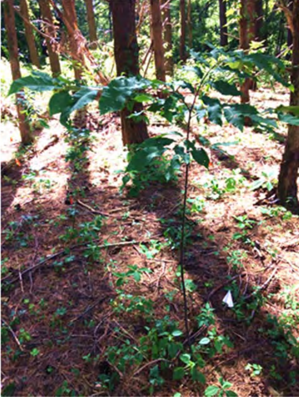
Figure 2: Three year old American chestnut hybrid growing underneath pine canopy.