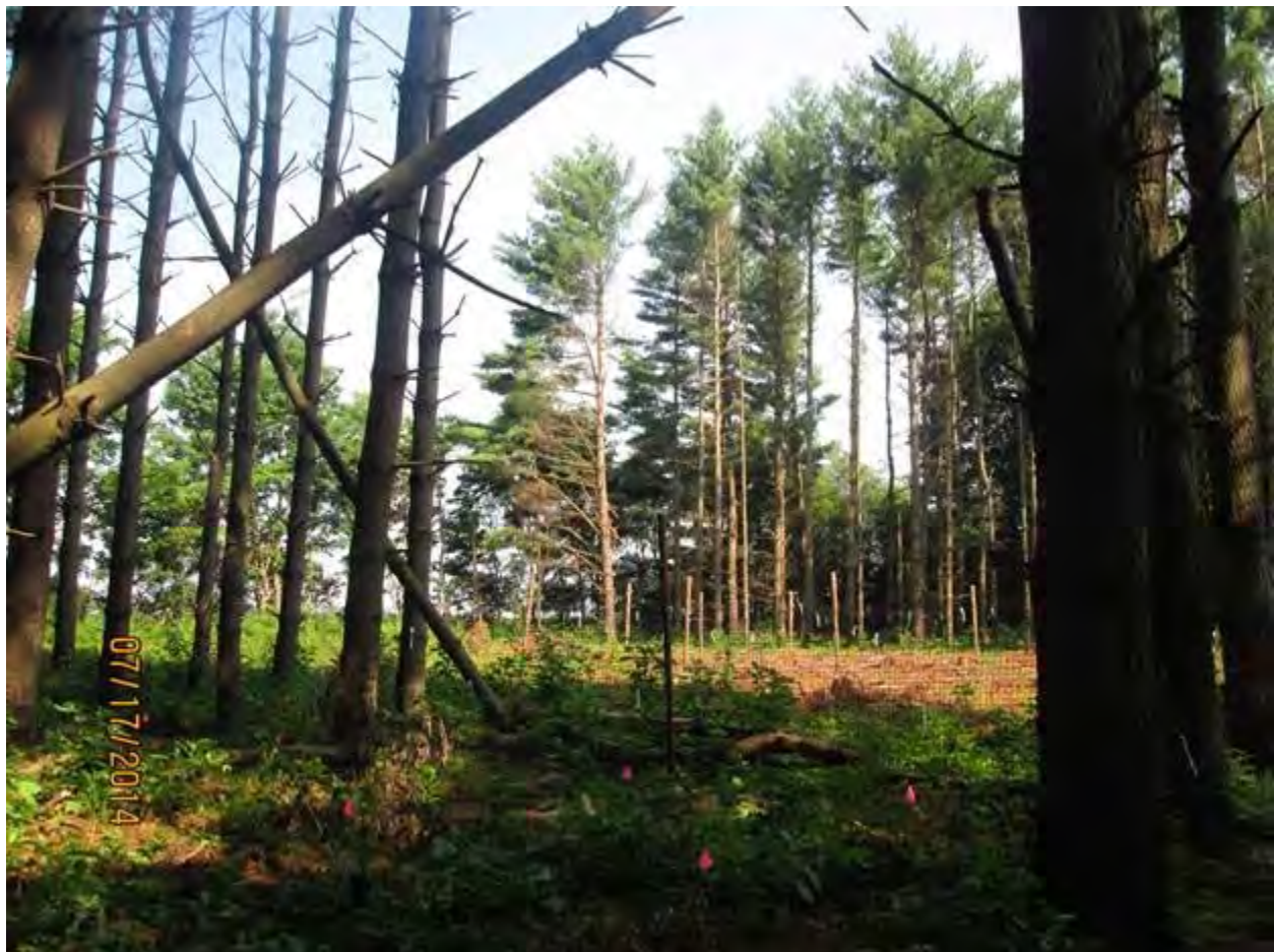
Figure 1: View from full canopy, looking toward clear cut and partial canopy removal manipulations.

American chestnut and northern red oak seedling 'success' is measured by survival, height, root collar diameter, photosynthesis rate, plant water status, and leaf nutrient analysis. To quantify differences in canopy manipulations and weeding treatments measurements include temperature, light intensity, vegetation functional composition, and soil physical and chemical characteristics. This research project can inform restoration of oak and chestnuts in pine plantations on public and private lands throughout the Midwest. These methods can be extrapolated to underplanting other hardwood species such as walnut or, in the distant future, ash. Other less productive plantations and environments can similarly be transformed to useful and more valuable forest.