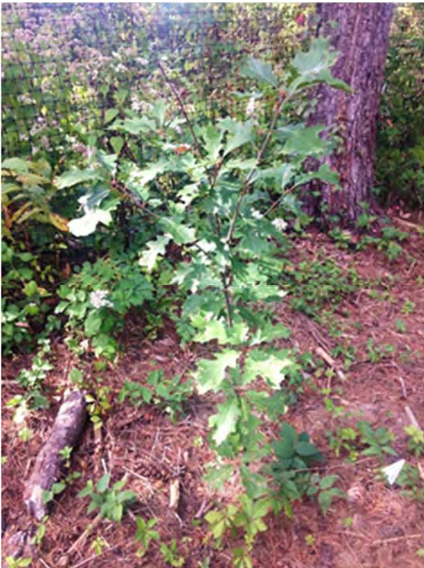
Figure 3: Three year old northern red oak growing underneath pine canopy.