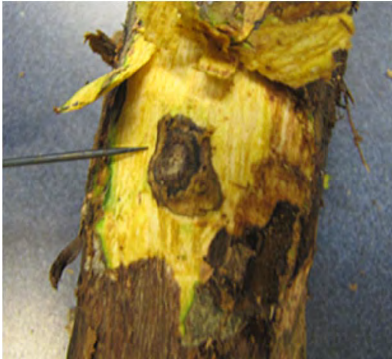
Figure 1: Canker caused by Geosmithia morbida on black walnut.