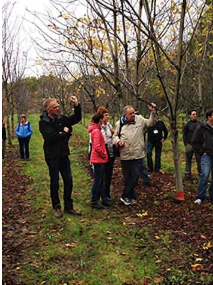
Figure 4. HTIRC staff and congress participants discuss the research projects visited during the field tour.