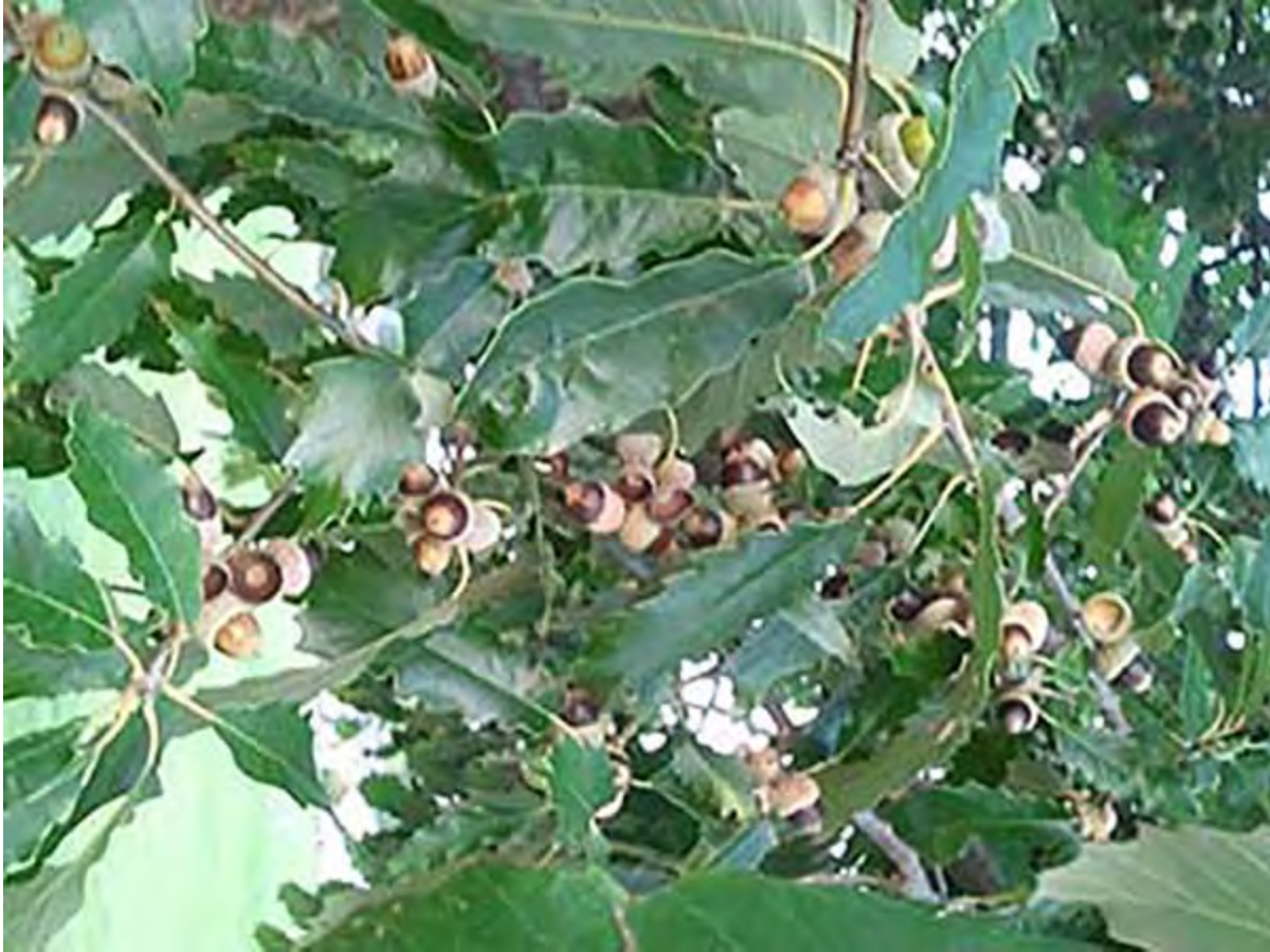
Figure 2. Chinkapin oak acorns clustered on branches.