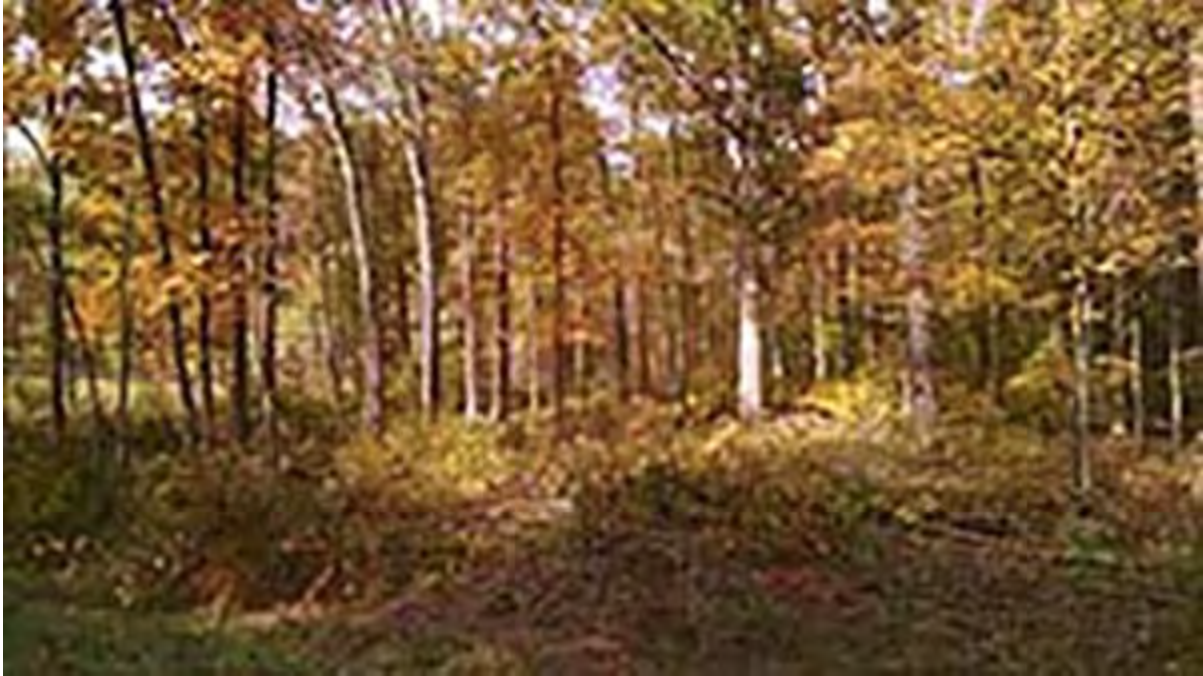
Figure 3. This oak-hickory stand has been treated with a midstory removal. This treatment results in much higher understory light availability and encourages growth of oak and hickory seedlings. The majority of the felled midstory trees were beech, flowering dogwood and maple.