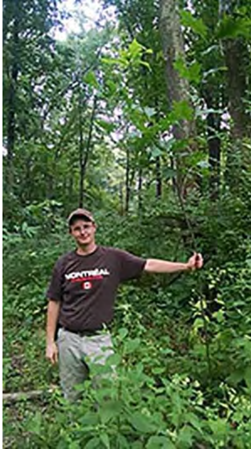
Figure 4. This oak sapling is benefitting from the increased light availability at the edge of a group opening. Its chance of canopy recruitment is much higher in this well-lit environment relative to closed canopy, mature forest.