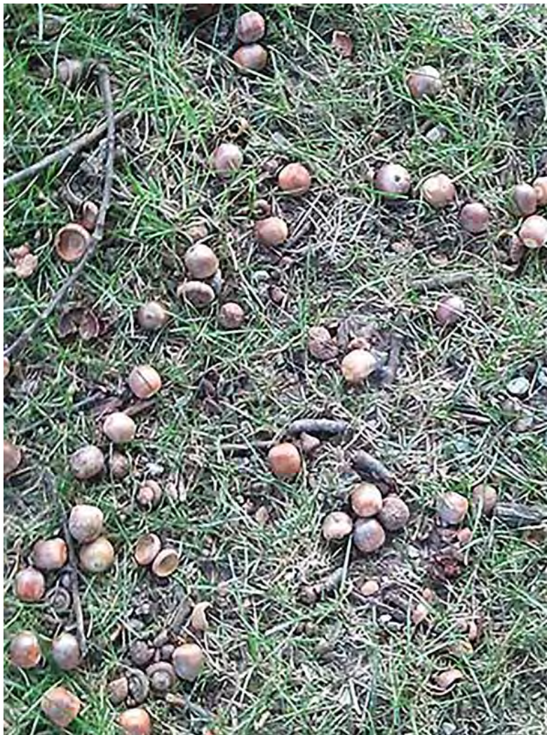
Figure 1. Northern red oak acorns cover the ground in a masting event.

SILVAH – A decision support tool for mixed oak and Allegheny hardwood stands in the eastern US which includes guidelines for tree regeneration - http://www.nrs.fs.fed.us/tools/silvah/