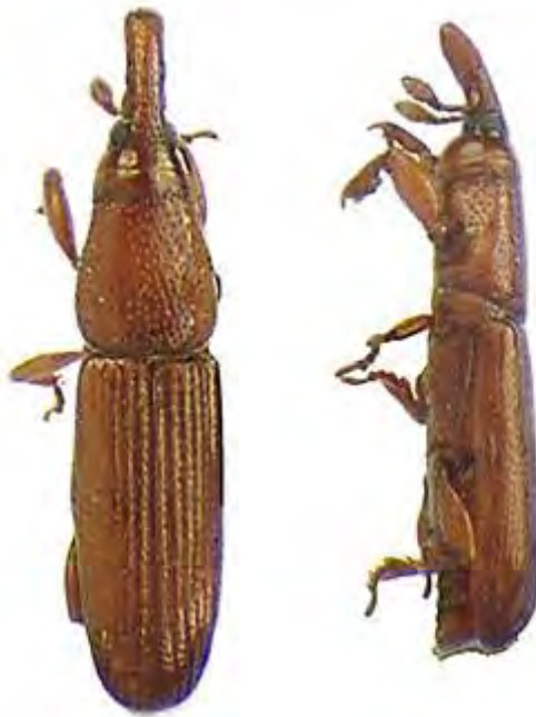
Figure 2: The weevil species, Stenomimus pallidus (Boheman) from which G. morbida was recovered. Length: 1.5 mm.