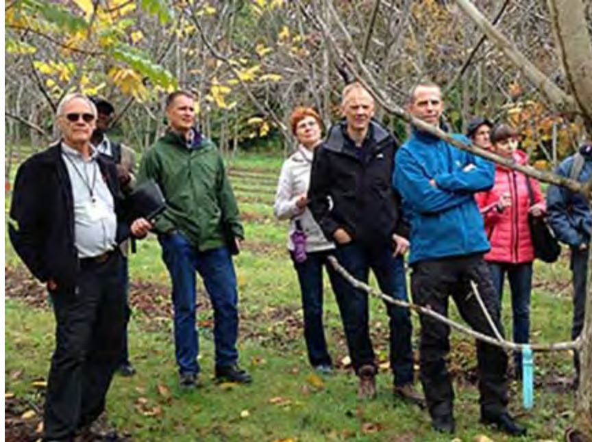
Figure 3. Congress participants tour the walnut collection planting of several walnut and butternut species and hybrids.