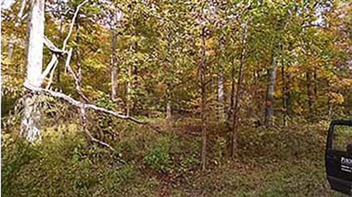
Figure 1. Prior to treatment, this mature oak-hickory stand has a dense midstory of shade tolerant beech, dogwood and maple saplings. This layer reduces light availability in the understory and inhibits the growth of oak and hickory seedlings.