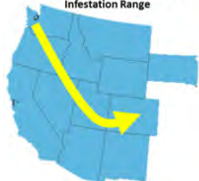
Current Mountain Pine Beetle US State Infestation Range

Could genome information gleaned from MPB be used to understand how some of the invasive beetles threatening Indiana hardwoods persist despite concentrated efforts to manage them? Are there existing similarities between natural conditions that limit range expansion of MTB and management tactics for invasive beetles in the east and Midwest?