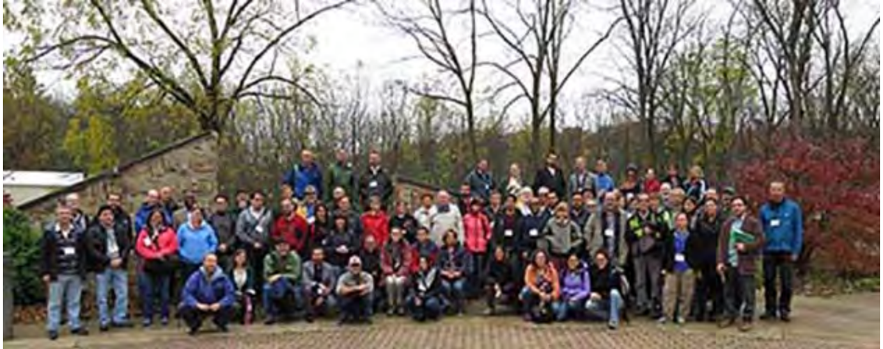
Figure 1. Participants gather prior to the field tour of HTIRC research sites at Martell Forest.