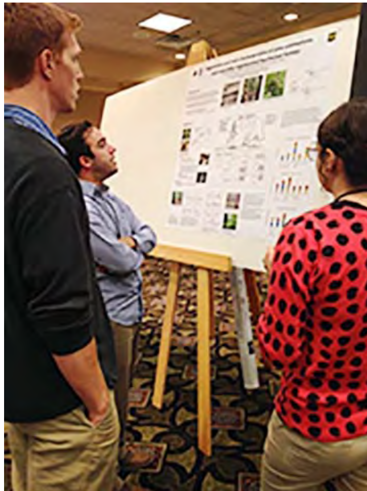
Figure 2. HTIRC students participate in the poster session of the congress.