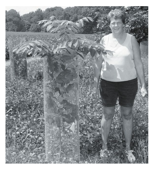
Figure 2.—Butternut plant (rooted cutting) after 2 years in the Southeast Purdue Agricultural Center field. For comparison, the woman in the photo is 160 cm tall.