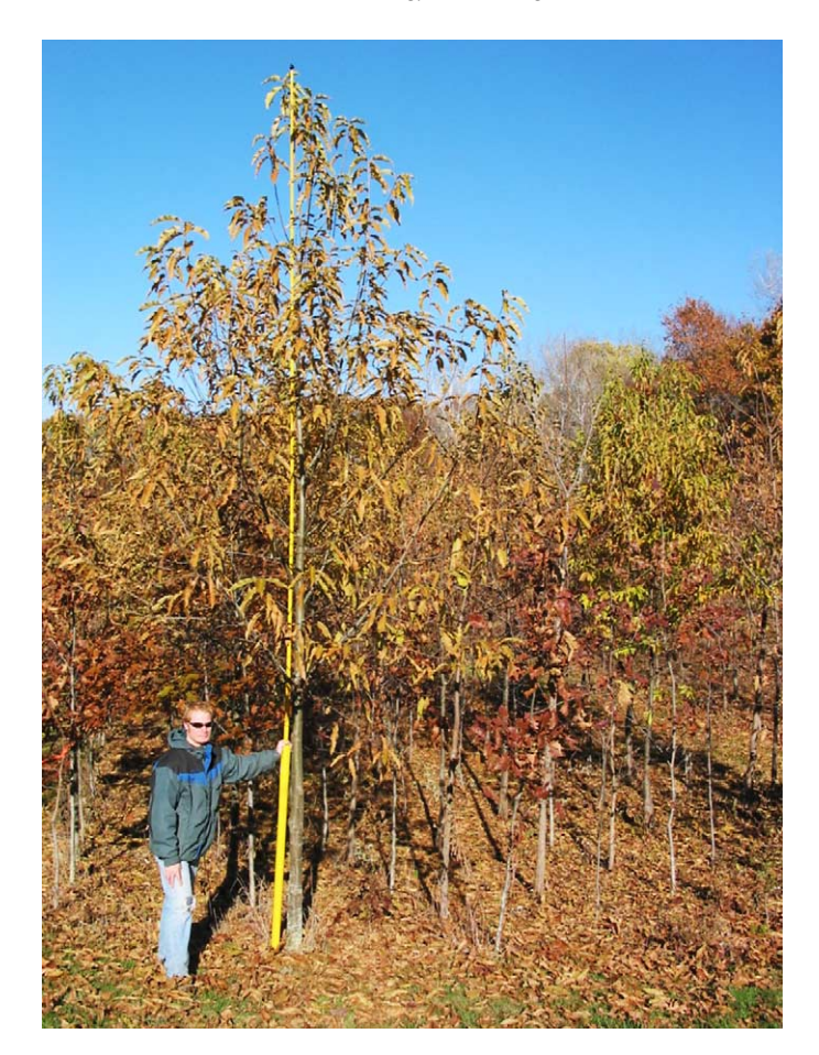
Fig. 3. Typical American chestnut 8 years following direct seeding.

species. This was probably partly a function of the dominance of American chestnut in this mixed planting, as much of the deviation in straightness of all trees appeared to be associated with growth toward canopy light patches. Maintenance of this relatively straighter form in mixed plantings, particularly when combined with exceptionally rapid growth, may make American chestnut a highly desirable species choice for timber production.